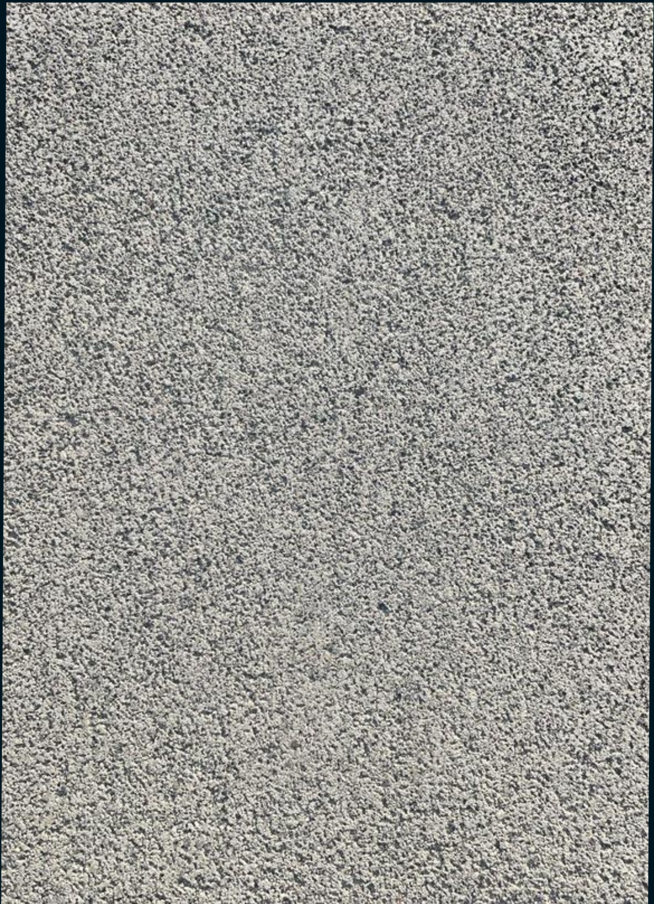
Concrete Black ACR1020

ACCOCRETE Coating are basically design to give the acoustic and thermal insulation properties for interior and exterior in the building. These coating are made with selected light weight concrete granules and lime bonded with water born chemicals. Accocrete coatings are having very good resistance against water and fire.