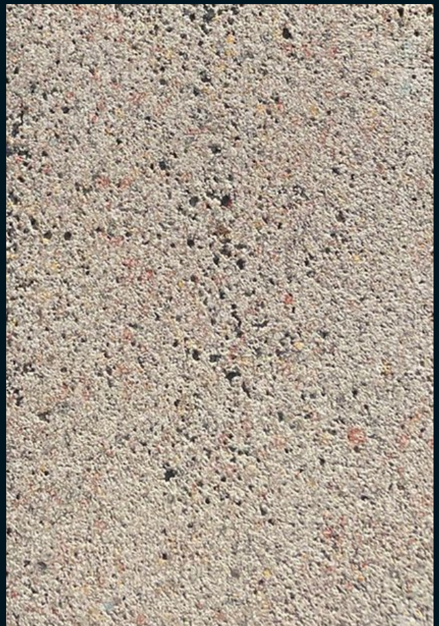
Concrete Mix ACR1032