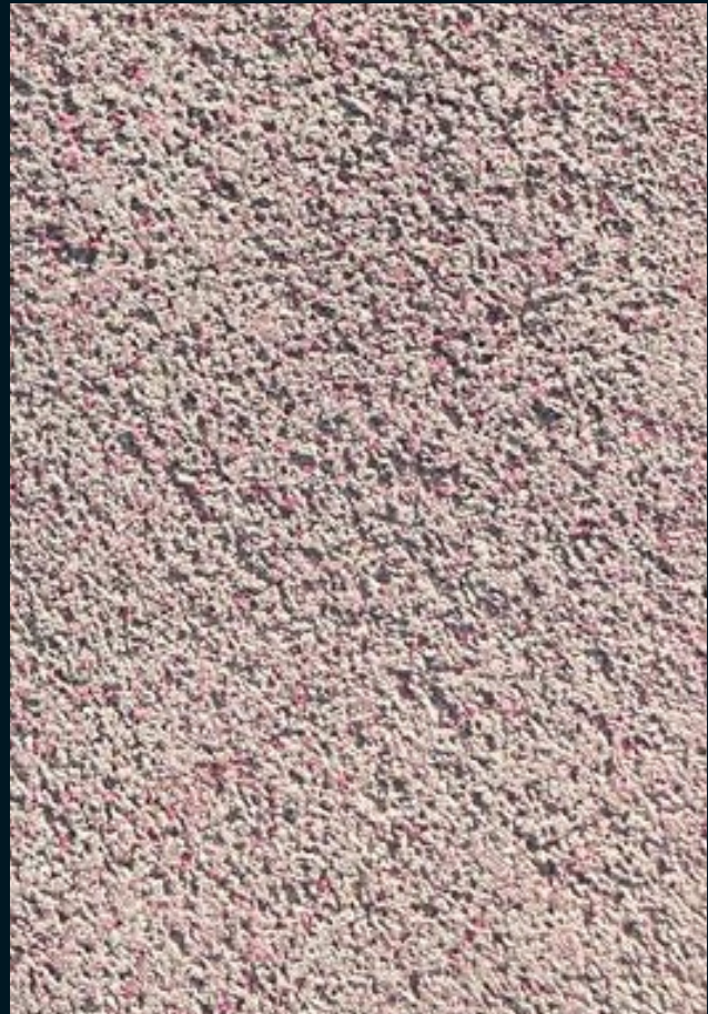
Concrete Pink ACR1028