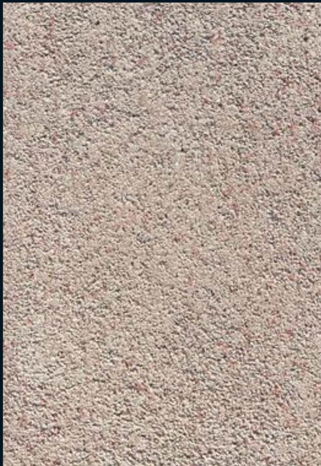
Concrete Red ACR1023