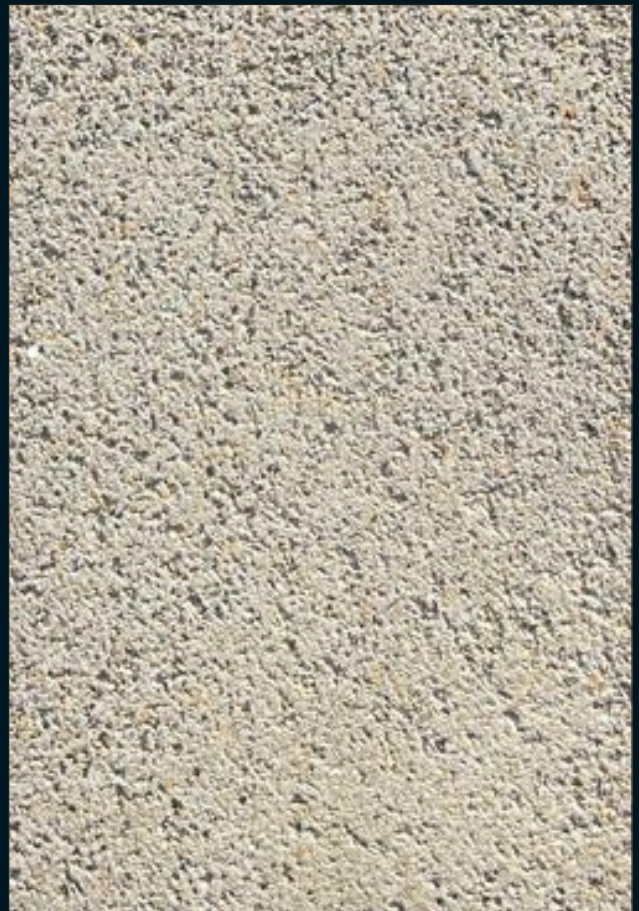
Concrete Yellow ACR1024