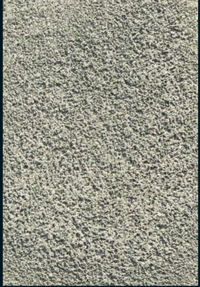
Concrete Green ACR1026