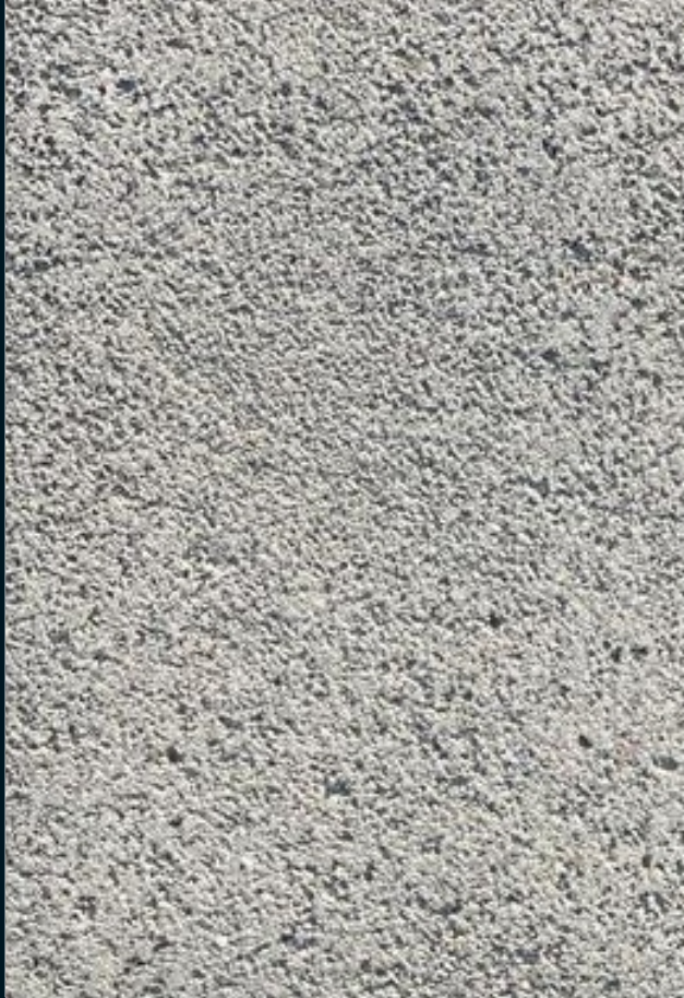
Concrete Grey ACR1021