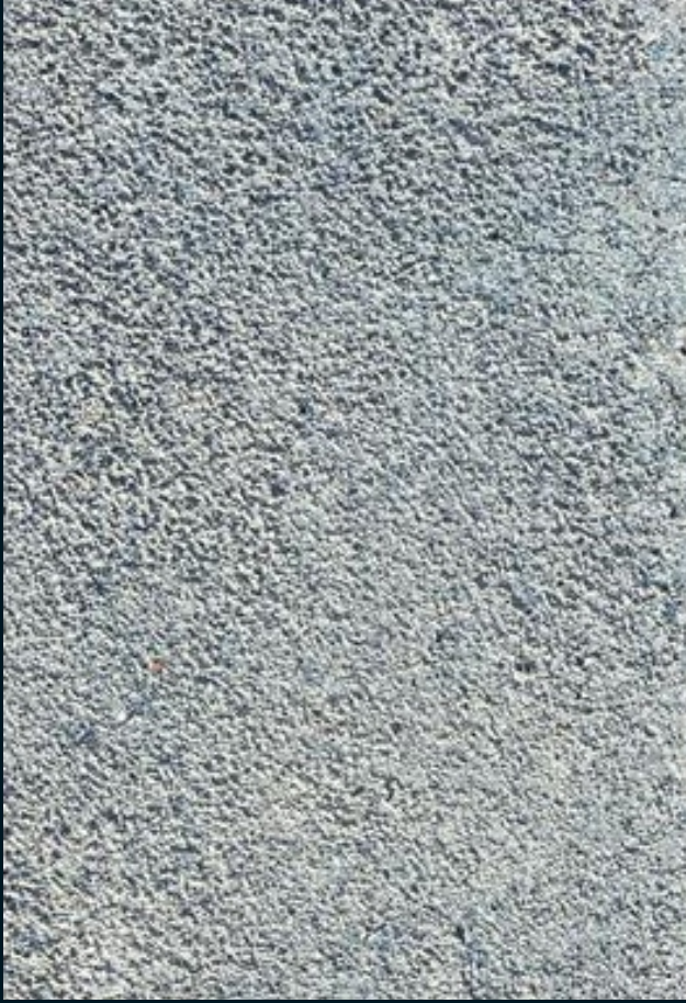
Concrete Blue ACR1025