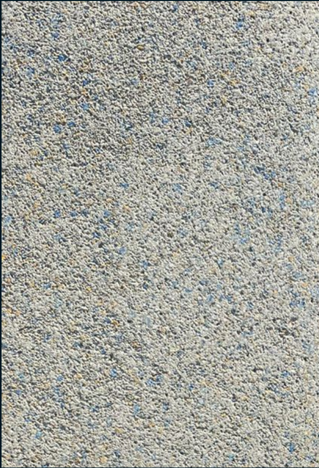
Concrete Mix ACR1029