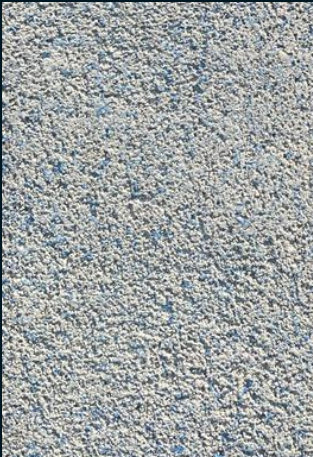
Concrete Sky Blue ACR1027