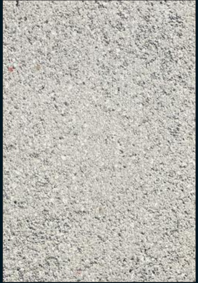
Concrete White ACR1022